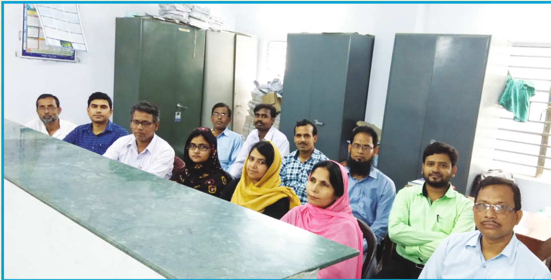
COLLEGE AND NSOU STAFF